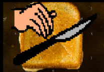
cut the hot sandwich in half