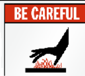
the sandwich is hot