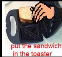
put the sandwich in the toaster