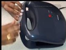
push the lid closed