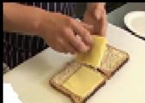
put the filling on 1 side of the bread