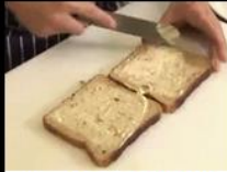
spread the butter