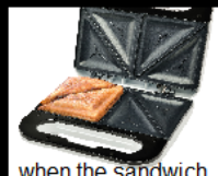
when the sandwich is cooked take it out